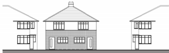
Street Elevation A-A